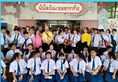
Naval Museum at Samutprakan