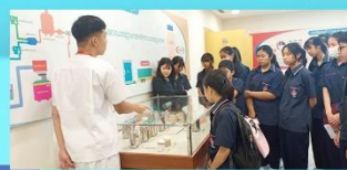
A study trip to Yakult factory and also study the management and marketing business.