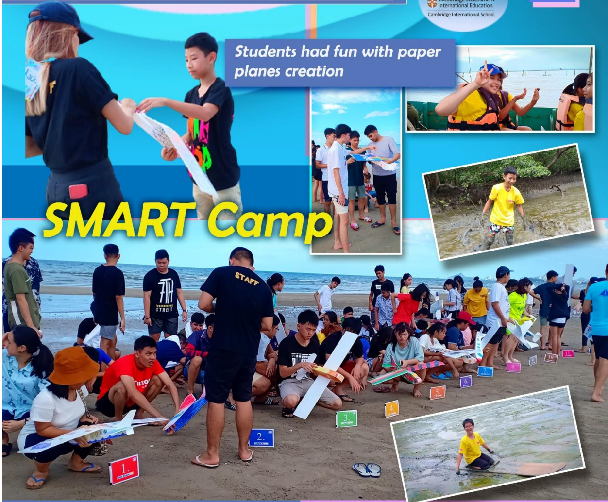
A camp for 60 students from grades 5-6 who passed the Top-Notcher Test, including one receiving YBIP scholarship.