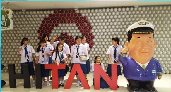
IP students visited Ichitan factory to study the process of production and marketing.