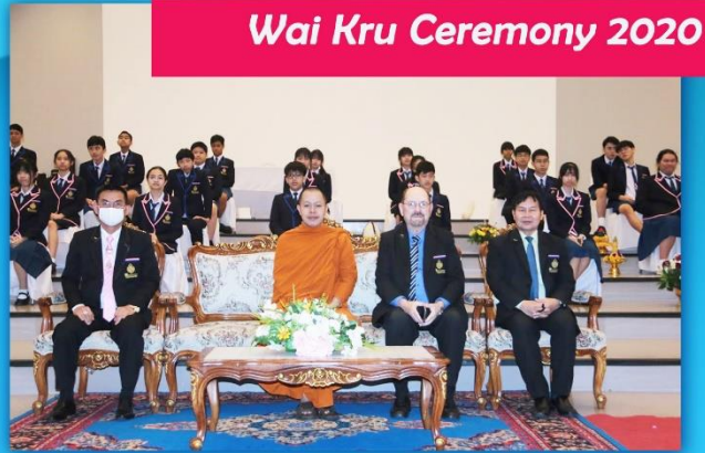
Wai Kru Ceremony 2020